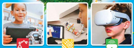
Robotics & Coding Circuitry & Electronics Tech Fun

FOR BOYS & GIRLS AGES 5-11, 9 AM - 4 PM DAILY