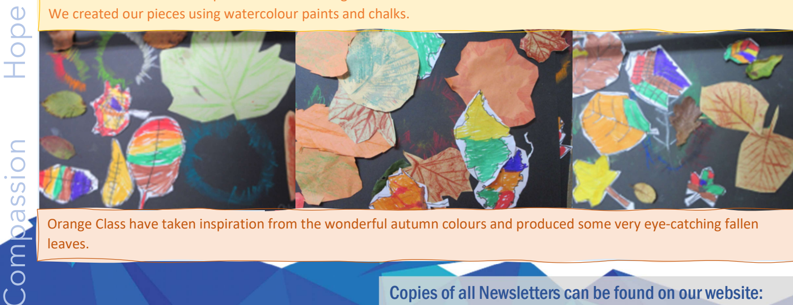
Orange Class have taken inspiration from the wonderful autumn colours and produced some very eye-catching fallen leaves.