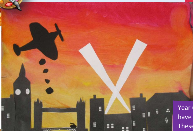
Year 6 are enjoying their WW2 topic at the moment and have been focusing particularly on life on the Home Front. These are some of the Blitz collages that they created.