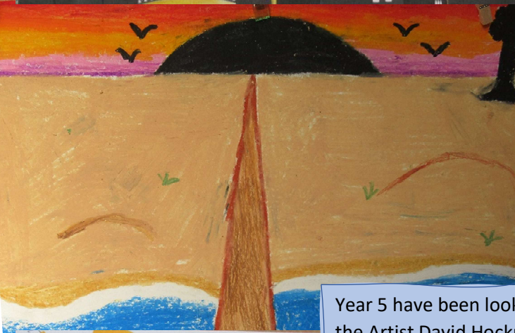
Year 5 have been looking at Perspective and the Artist David Hockney has been the inspiration for their work.